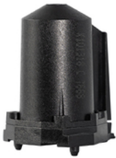
Ink cartridge P1-EF-RD for egg marking