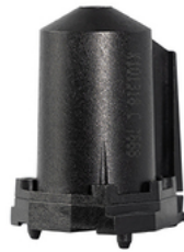
Ink cartridge P1-EF-AUB for egg marking